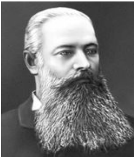
V.V. Dokuchaev (1846-1903)

This was the first ever Chair of Soil Science not only in Imperial Russia (whosubordinateswere Ukraine and Poland), but also in the whole world. Viewing up the 120-year history of the Dokuchaev Chair, it should be noted that main vector (and the core) of its activities have ever been educational, sciential and exploration activitiesinfelicitousjoint with agricultural industry. At every stage of its elaborate history, the Dokuchaev Chair was a bearer of advanced and,often, absolutely innovativelines of Soil Science evolution.