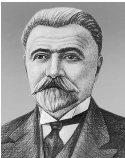
K.D. Glinka (1867-1927)

K.D. Glinka issued his "Textbook on Soil" published in six editions, including a version in English. He had developed a new genetic classification of soils of the world, having pioneered in substantiating five major types (i.e., podzolic, boggy, steppe, solonchized and laterite) of soil-formation entailing 25 types of soils. He was the first scientist to draw one's attention (1911) to profile- evolution of some soil- types, through upper horizons' illimerization. Later (in 1956) Philippe Duchaufour named this process "lessivage" (a French analogue of English "leaching").